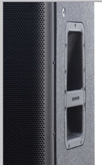
Integrated carry handle

Samson's RSX110 is a high performance, 2-way passive loudspeaker ideal for sound professionals and performers looking for serious output and precision sound quality from their PA setup. Perfect for gigging musicians, houses of worship and performance venues of varying sizes, the RSX110 offers professional sound in a versatile cabinet that is ideal for both road and installation applications.