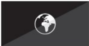
Global monitoring of all AV devices

Multiple ZU510T's can be monitored over LAN and also provide the user with an email message alert in case an error occurs or a light source fails or needs to be replaced, using Crestron RoomView. While the web browser interface and full support for Extron's IP Link, AMX dynamic device discovery and PJ-Link protocols, allow almost all aspects of the ZU510T to be controlled across a network, keeping you in control, wherever you are.